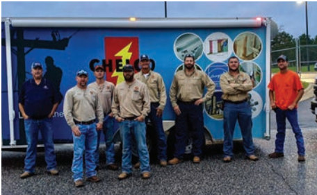
CHELCO's Baldwin EMC restoration crew

Hurricane Sally left our area with significant damage and flooding, but within two days of Sally's landfall as a Category 2, all CHELCO members whose homes and businesses could receive power were restored. A few weeks later, we closely watched as another Category 2, Hurricane Delta, formed and eventually made landfall in Louisiana.