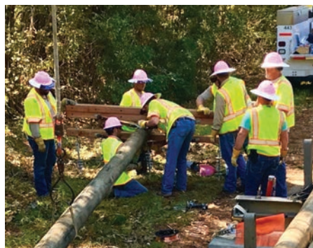
Wearing pink hard hats in honor of Breast Cancer Awareness Month, CHELCO's crew worked hard to help DEMCO restore power to its members.